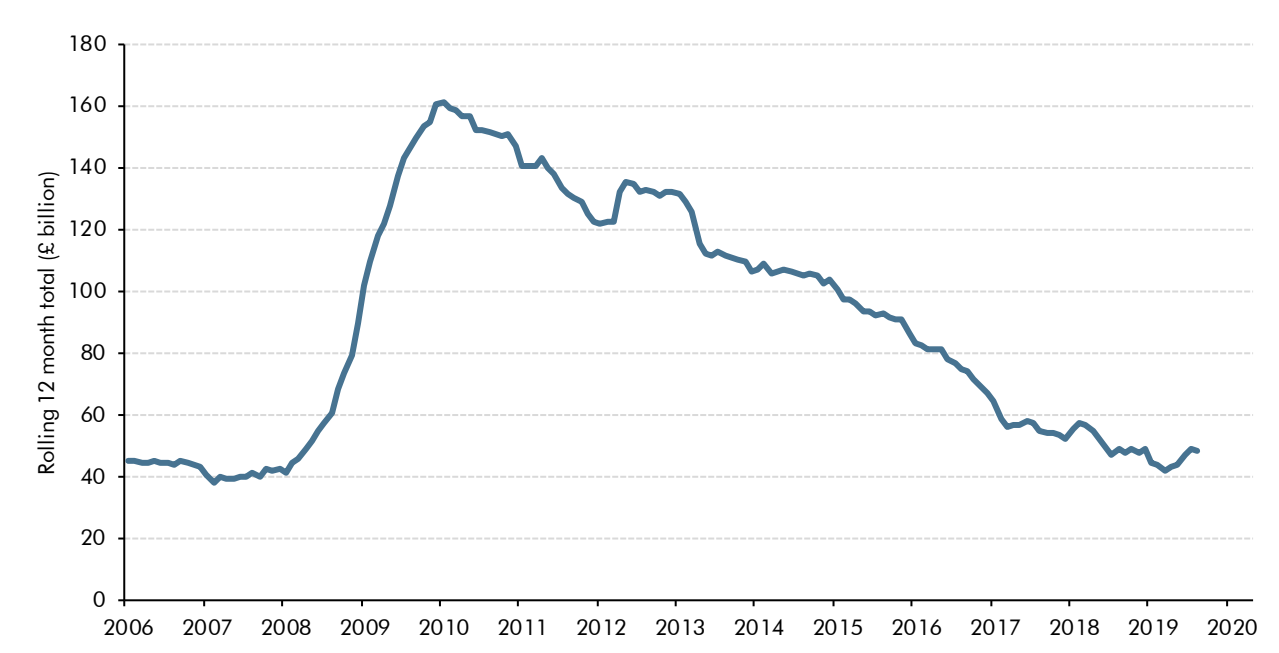
Chart 1.1: Public sector net borrowing: rolling 12-month total