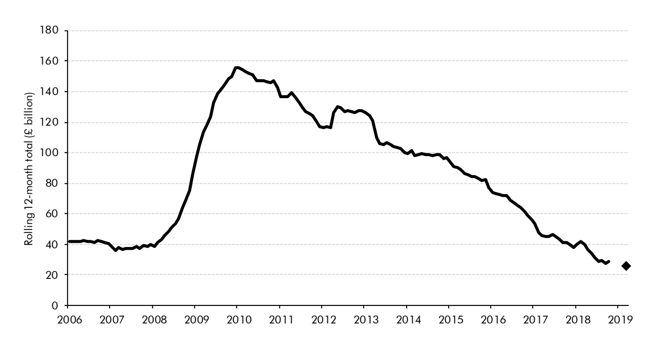
Chart 1.1: Public sector net borrowing: rolling 12-month total